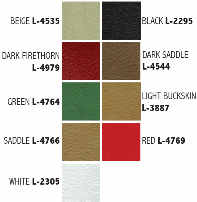
1974-76 Camaro Standard Colors